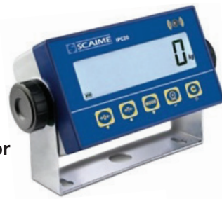
IPC 20 std indicator