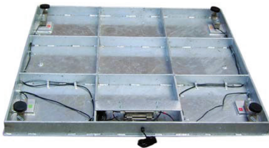
Underneath Flat Bar Construction