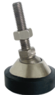
Ball & Cup Feet